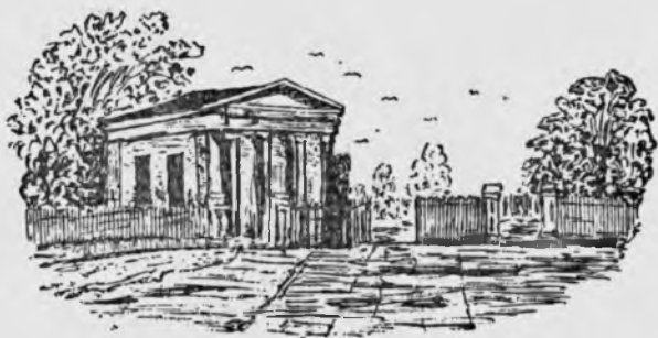
OXFORD PLACE LODGE