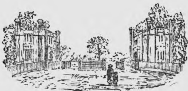
Northeast Lodges LONGSIGHT