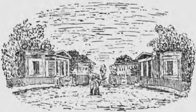
South West Lodges RUSHOLME GREEN