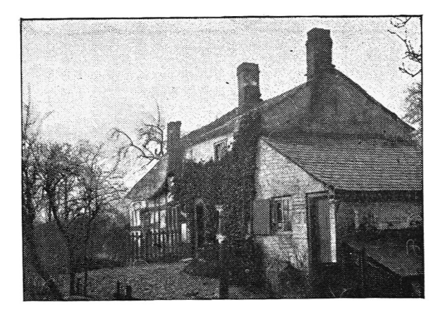
BIRCH FOLD COTTAGE.