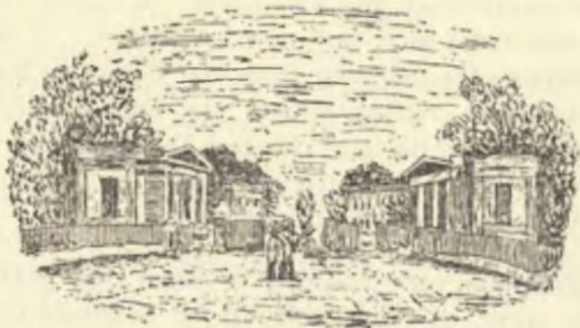
South West Lodge RUSHOLMS GREEN