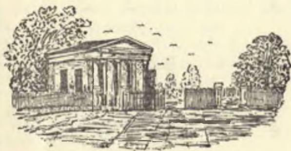
OXFORD PLACE LODGE