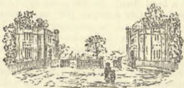
North-east Lodges LONGSIGHT