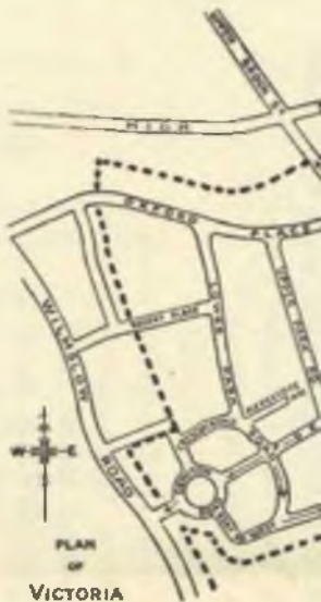
PLAN OF VICTORIA PARK 1937